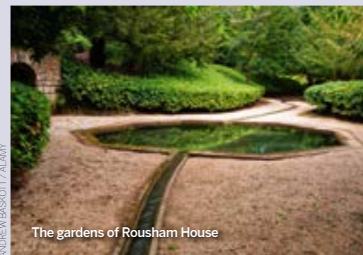
The gardens of Rousham House

Rousham is perhaps every garden designer's favourite garden. Go in February when the bones are all you see and the light is soft. Beauty can come from just leaves, water and stone. Who needs flowers? Garden open daily. Rousham House & Garden, Steeple Aston, Bicester, Oxfordshire OX25 4QU. Tel 01869 347110, rousham.org. Ashwoods Nursery is an exquisitely kept nursery