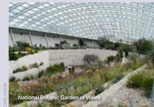
National Botanic Garden of Wales

Painswick has one of the largest naturalistic plantings of snowdrops in the country. Open 10 January to end of October. Painswick, Gloucestershire GL6 6TH. Tel 01452 813204, rococogarden.org.uk. The National Botanic Garden of Wales is a great place to visit at any time of the year, but in February when the weather is bad you can spend the day in the